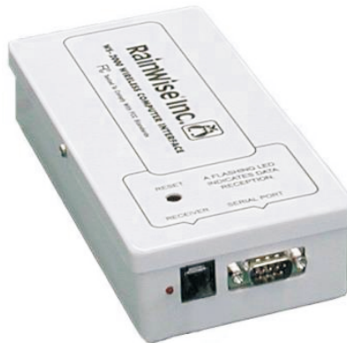
CC-2000 Computer Interface