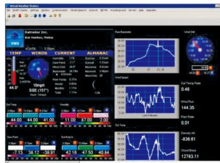
Virtual Weather Station screen