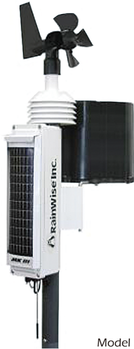
Model : MK III